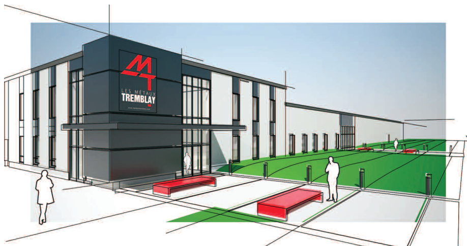
New site: 2025 de la Métropole Boulevard, Longueuil, Quebec

The Company will move into the new premises in November 2010.